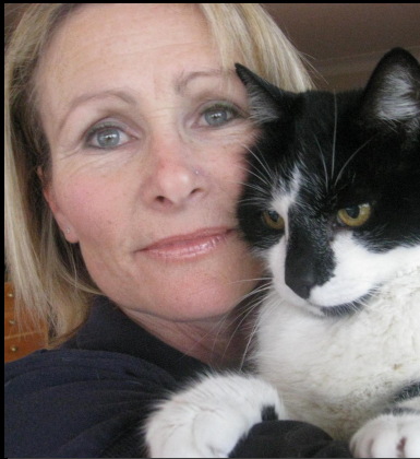
SENIOR FELINE ATTENDANT